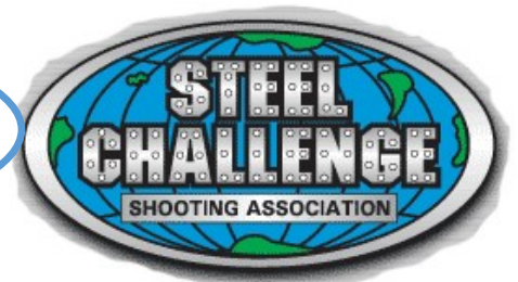
C TAGA .22 Steel Challenge