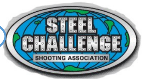
CTAGA .22 Steel Challenge